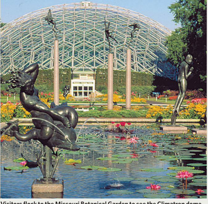
Visitors flock to the Missouri Botanical Garden to see the Climatron dome.

Apart from its undoubted geeky appeal, such a technology would in principle save a lot of time and drudgery. Carrying out identifications for colleagues at home and round the world is time consuming and uncompensated. The use of